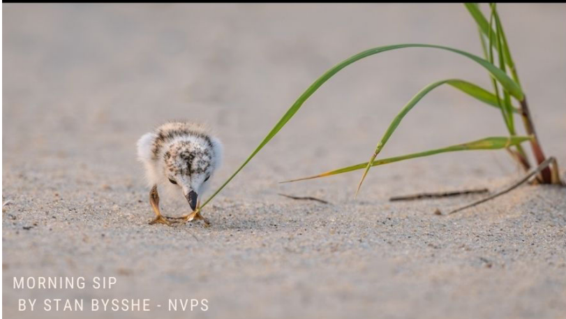
MORNING SIP BY STAN BYSSHE - NVPS