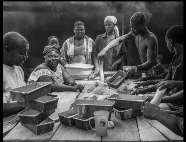
"FAMILY MAKING BREAD IN GHANA"